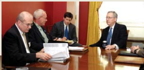
KAPA meets with Senate Minority Leader Mitch McConnell in 2008

We support executive and legislative initiatives that enhance the quality and affordability of EMS. We are well-represented on the Kentucky Board of