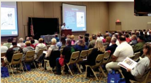
Kentucky EMS Conference & Expo

We have sponsored the state's largest annual EMS conference and Expo since 1990. And we received